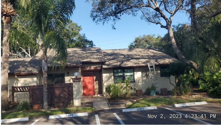
Project: 2949 Yucca Ct Date: 11/2/2023, 4:23pm Creator: Hector Reyes