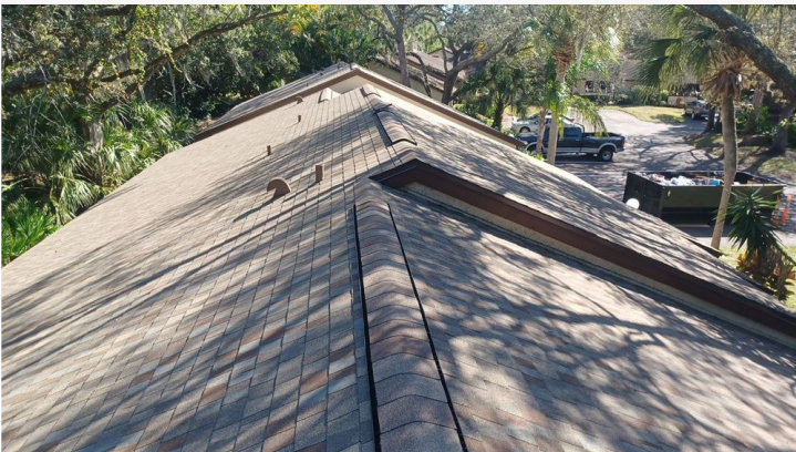
Project: 2949 Yucca Ct Date: 11/2/2023, 3:09pm Creator: Lucio Roofer