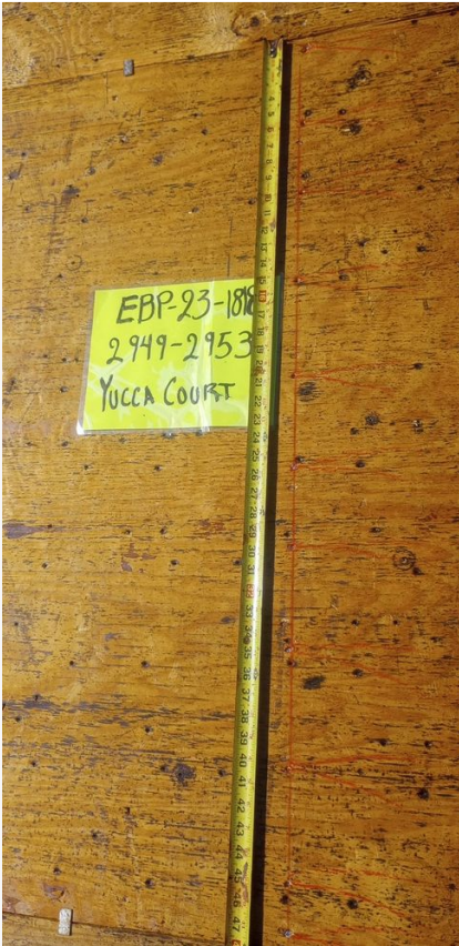
Project: 2949 Yucca Ct Date: 11/1/2023, 4:33pm Creator: Lucio Roofer