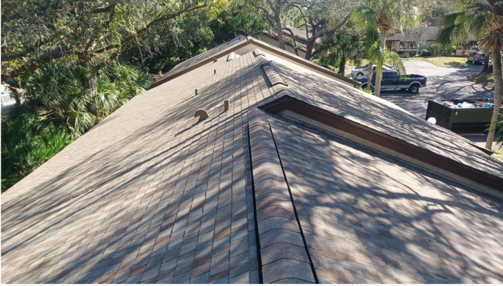
Project: 2949 Yucca Ct Date: 11/2/2023, 3:09pm Creator: Lucio Roofer