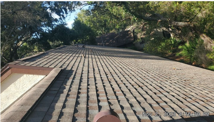
Project: 2949 Yucca Ct Date: 11/2/2023, 4:16pm Creator: Hector Reyes