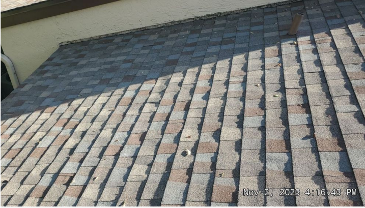
Project: 2949 Yucca Ct Date: 11/2/2023, 4:16pm Creator: Hector Reyes