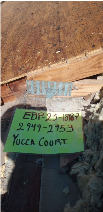
Project: 2949 Yucca Ct Date: 11/1/2023, 4:33pm Creator: Lucio Roofer