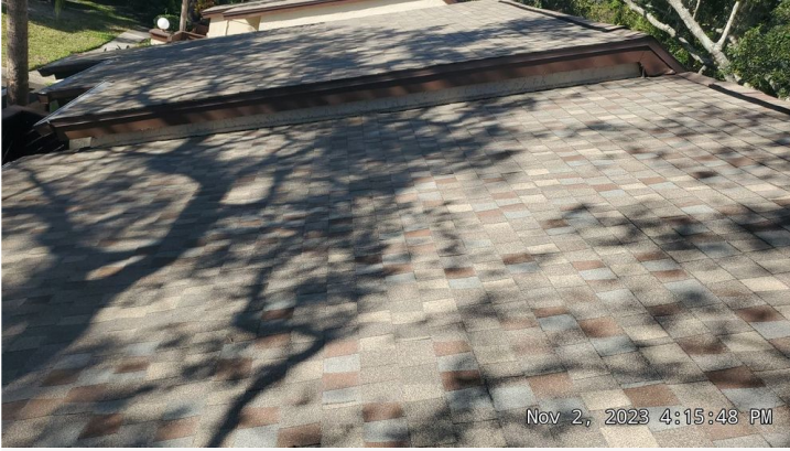
Project: 2949 Yucca Ct Date: 11/2/2023, 4:15pm Creator: Hector Reyes