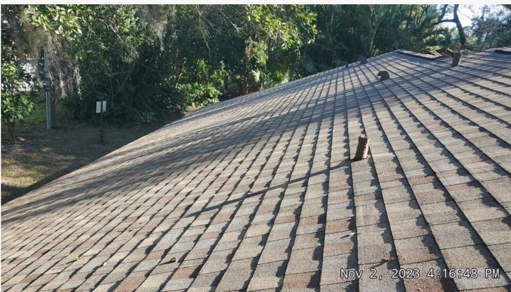
Project: 2949 Yucca Ct Date: 11/2/2023, 4:16pm Creator: Hector Reyes