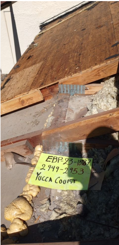
Project: 2949 Yucca Ct Date: 11/1/2023, 4:33pm Creator: Lucio Roofer